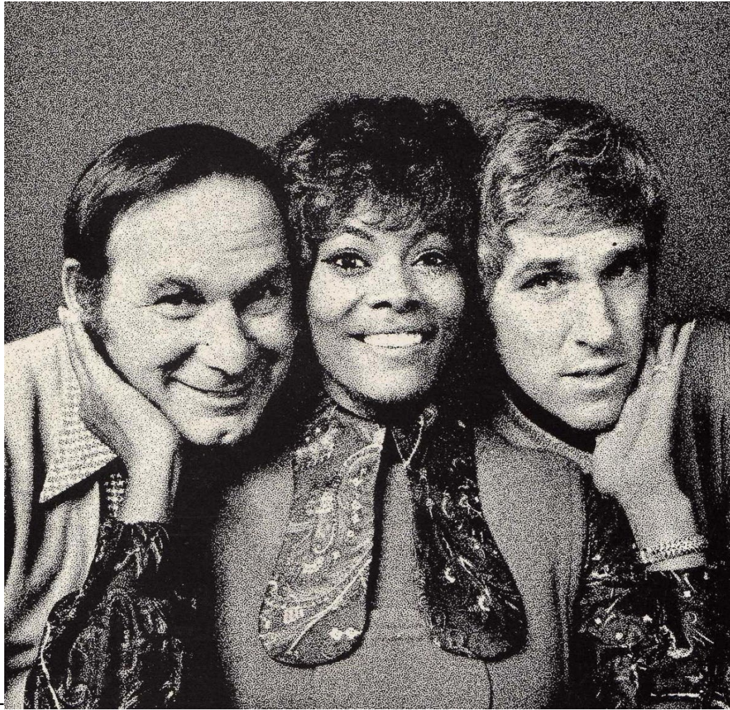
Hal David, Dionne Warwick, and Burt Bacharach, the dream team